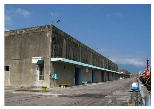
The old docks and harbour buildings at Karenko

In the afternoon I set out to trace and confirm the route the POWs had taken to get to and from Karenko Camp. The Americans were marched to the camp from the harbour when they disembarked, but a couple of weeks later the British contingent were first put on a local train and taken to the downtown station and then marched the rest of the way to the camp. I also met with a local historian friend and visited the Hualien Culture Bureau for permission to visit the base.