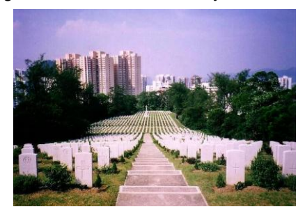
Sai Wan War Cemetery, Hong Kong

While some war graves organizations charge for their photos, there are other organizations that do not. The Australian War Graves Photo Archive and the Canadian "Maple Leaf Legacy" Photo Project are two such organizations who provide photos free of charge, and there are individuals in the UK and other places who have websites offering free photos as well. You can Google "War Graves Photo Projects" to learn more.