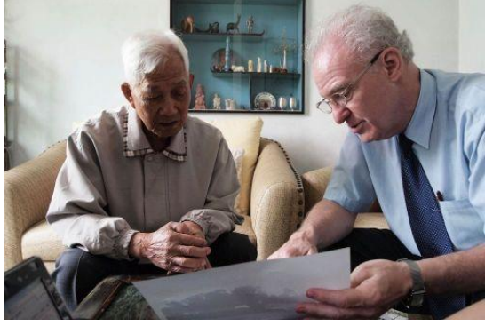
Interviewing former POW camp guard from Karenko & Shirakawa camps