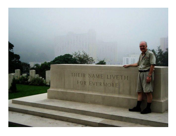
Taiwan POWs graves photographed at Sai Wan War Cemetery