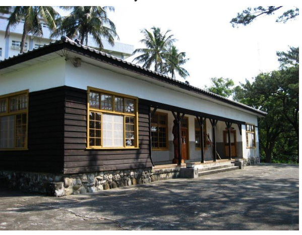
The camp headquarters building restored

He took me all around the camp and we explored every part and actually uncovered the overgrown remains of two of the former Japanese storage sheds. The military base has restored the former Japanese camp commandant's house and office – it is used as a meeting hall now. We also located the foundation of the former Japanese camp guards billet, the remains of the pig and goat shed and the walkway and washroom foundations behind the POWs' 2-storey barracks.