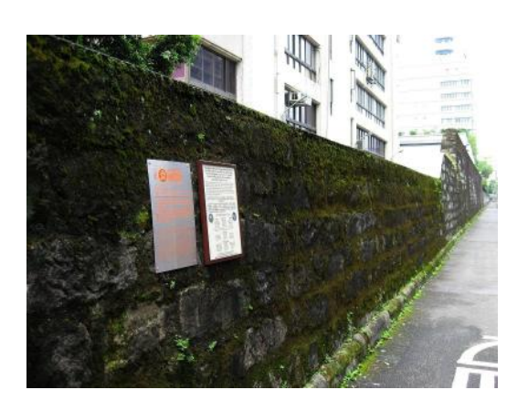
New Taipei City Gov't historical plaque installed on Tainei Prison Wall