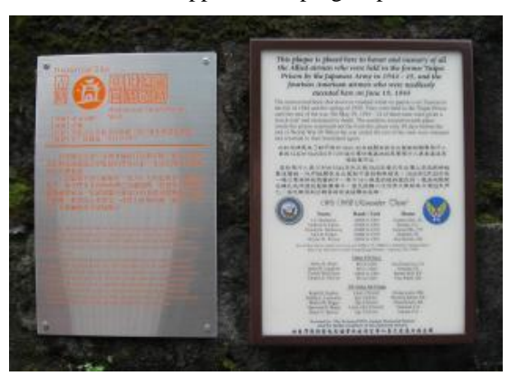
City Gov't. Prison Wall historical plaque on left

We are very grateful to the two branches of government for their interest and support in helping us preserve history.