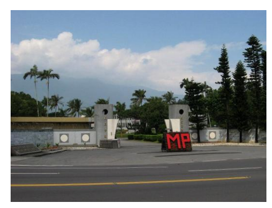
Exploring the former Karenko senior officers' POW Camp at Hualien